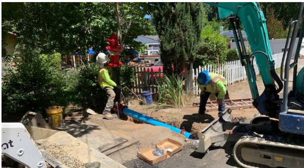
Pictured: Installation of a New Fire Hydrant at 2850 Mosquito Road

Please feel free to contact us directly with any questions or concerns